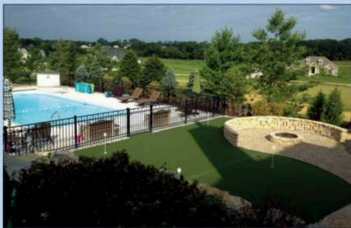
FROM TOP: One of the most popular features to enjoy in an outdoor space is the firepit. Firepits can be built in a variety of styles using many decorative materials that will make it special for your family; Begin your afternoon with a swim in the sparkling pool or sunning around the deck. Then head for the putting green to practice your stroke. End the day gathered around the firepit – the perfect day.