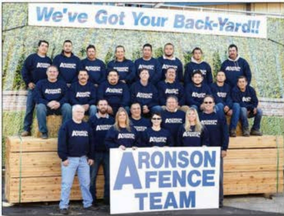
ARONSON FENCE TEAM